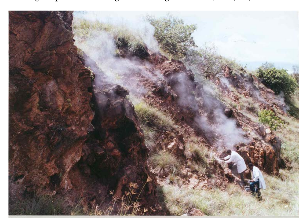
FIGURE 3: Fumaroles in the Kenya Rift

Temperature dependent gas-gas and or mineral gas equilibria are believed to control the concentrations of gases like CO_2 , H_2S , H_2 , N_2 , NH_3 and CH_4 in geothermal reservoir fluids. Arnorsson and Gunnlaugsson (1985) proposed temperature functions for six geothermometers applicable to fumarolic steam. Three (3) were based on the concentrations of CO_2 , H_2S , and H_2 respectively. Two (2) were based on the gas ratios ( CO_2/H_2 ) and H_2/H_2S ). The gas concentration is in mmol/kg of steam.