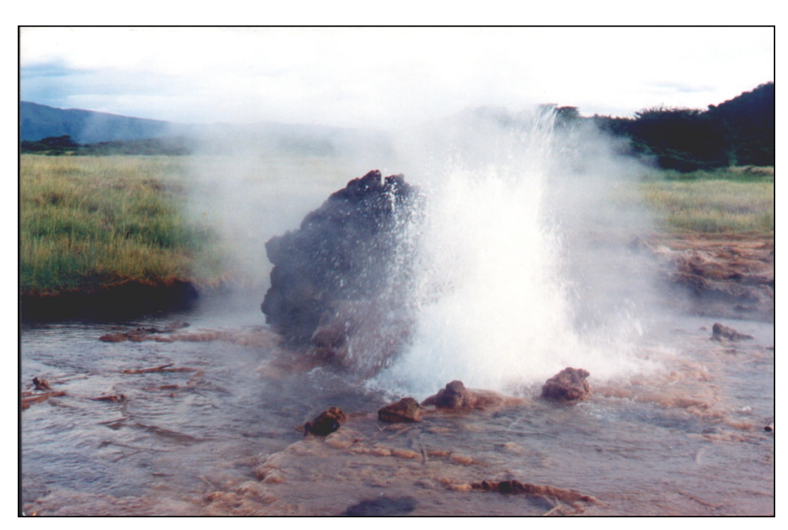
FIGURE 2: Hot geysers at Lake Bogoria geothermal prospect in the Kenya Rift

2. Conductive (no steam loss) – this equation represents experimentally determined solubilities and applies to those waters that cool solely by conduction during ascent. The silica quartz conductive cooling geothermometer is best used for springs at sub-boiling temperatures (giving a maximum estimate of the reservoir temperatures based on quartz solubility), or for well data that have been calculated to reservoir conditions.