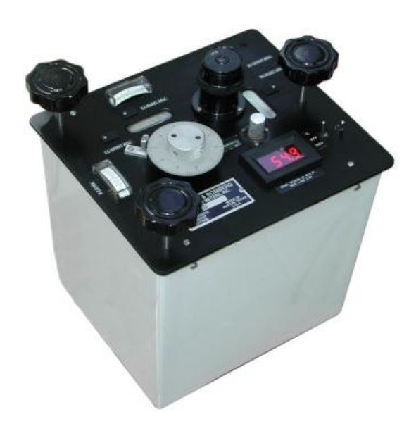
FIGURE 2: Some commonly used gravity meters (a) Scintrex CG-5 Autograv (b) Lacoste & Rhomberg gravity meter

The survey design is based on the anticipated depth of investigation, density contrast and structure of the geological feature. Additional parameters to take into account for the survey design are the accuracy