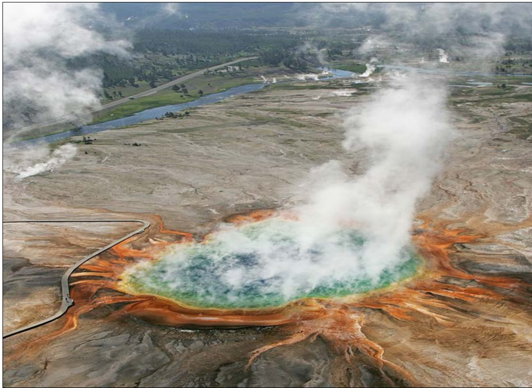
FIGURE 4: Hydrothermal explosion in Ahuachapan geothermal area