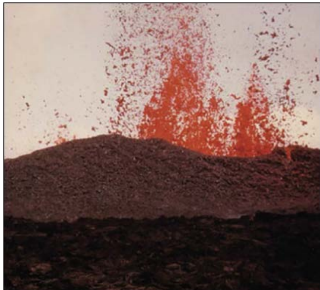
FIGURE 2: Eruption of the Krafla volcano, Iceland

In the EARS, volcanic eruptions are different as regards to area and type (Saemundsson, 2017). For example, further north in Djibouti and Ethiopia, basaltic fissure eruptions are predominant along elongate volcanic systems such as Ardoukoba, which last erupted in 1978, and Dabbahu, which last erupted between 2005-2008. History of volcanic eruptions in Kenya (as studied by Leat, 1984; Scott, 1980; and Naylor, 1972) has provided a list of volcanoes and when they were last active as shown in Figure 3.