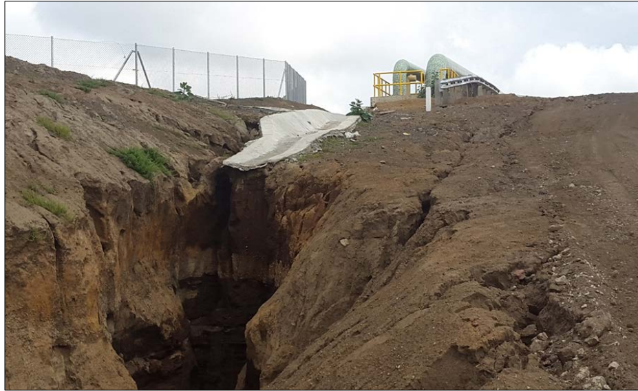
FIGURE 3: A deep crevasse caused by flash floods due to the loose cover of the pyroclastic material. The steam line and fence will be washed away if no remedial measures are taken.

river flooding, caused by excessive run-off brought on by heavy rains and, (ii) sea-borne floods, or coastal flooding, caused by storm surges, often exaggerated by storm run-off from the upper water shed. Flash floods is a recurrent geohazard and is particularly aggravated by the nature of the overlying material. During flooding, supply roots and other infrastructure get affected (Figure 6) due to which flooding also produces endemic diseases that intensifies the severity of the flood impact, particularly health hazards to fauna and flora including humans.