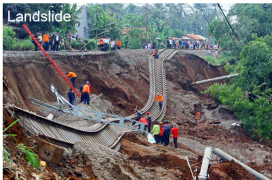
FIGURE 1: Landslide near one of the geothermal prospects in Indonesia

According to Arya et al. (2005), flash flood represents a temporary inundation of large regions as the result of an increase in reservoir, or of rivers flooding their banks because of heavy rains, high cyclones, storm surge along coast, melting snow or dam bursts. Two types of flash floods can be distinguished namely; (i) land-borne floods, or