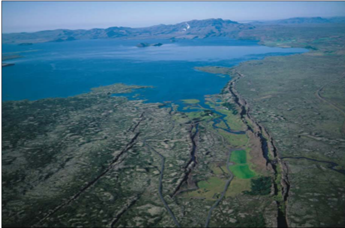
FIGURE 2: Active fault movement in high temperature Krafla geothermal field in Iceland

A fast-moving, and potentially lethal, consequence of volcanic eruptions is the lahar. These torrential flows of mud, water, and debris wash down the sides of the volcano and are often associated with crater lakes, melting snow or ice, or heavy rainfall events, with or without a concurrent eruptive event. Lahars from some volcanic lakes may be hot and are often acidic. For communities situated in the path of lahars, the opportunities for timely warnings may be limited—sometimes with lethal consequences. In a lahar generated from the 1919 eruption of Kalut in Indonesia, 5000 people died. Those caught in the flow suffered from drowning, suffocation while entrapped, or severe trauma from penetrating wounds and fractures. In New Zealand, a lahar from Mt. Ruapehu in 1953 washed out a rail bridge shortly before the arrival of the main train servicing the North Island (Bhandari, 2006). The front carriages plunged over the edge of the washed-out bridge with a catastrophic result: 151 killed out of the 285 people on board.