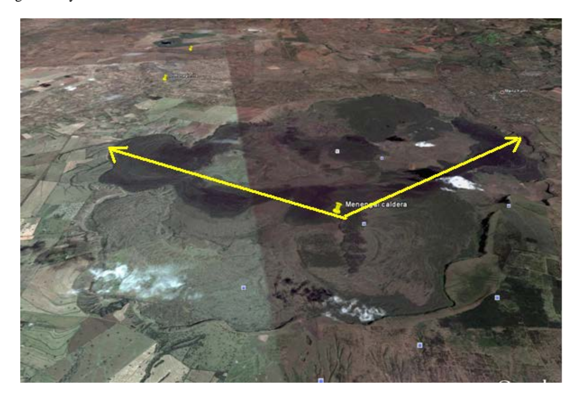
FIGURE 4: Satellite image of Menengai caldera. The dark lava flows on trachytic eruptive centres imply orientation to the northeast and northwest and these can be inferred as structures.

well calibrated equipment so that if extrapolations are to be made for modelling purposes the error margin is very slim.