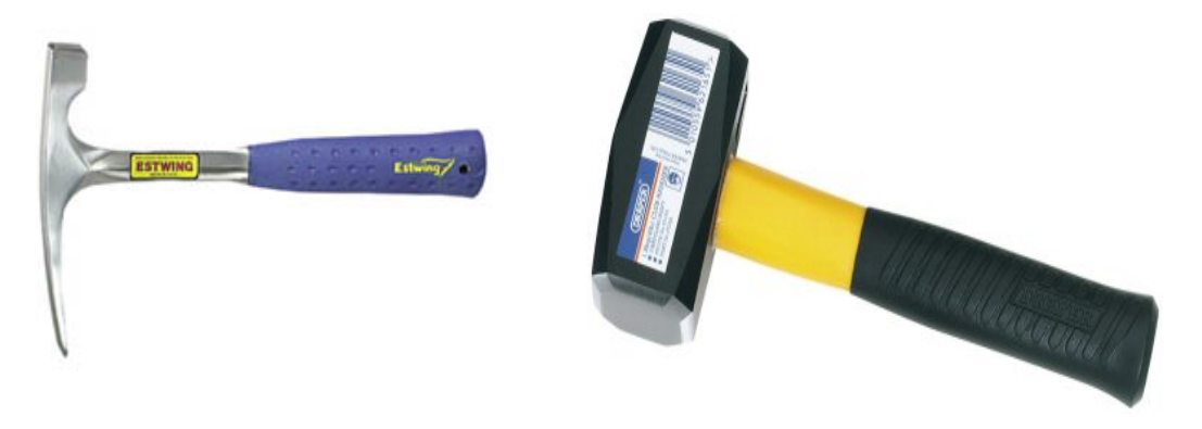
FIGURE 3: Chisel head and crack geological hammers