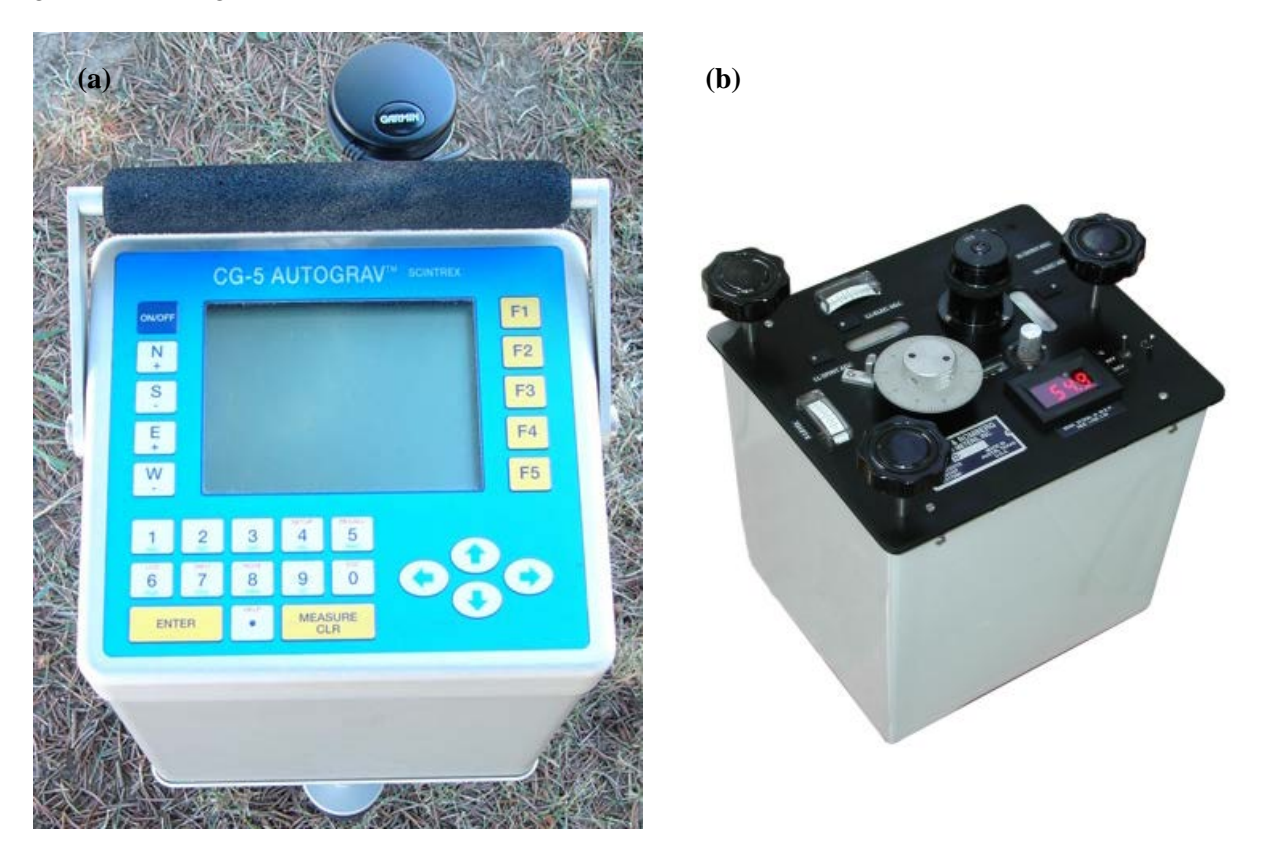
FIGURE 2: Some commonly used gravity meters (a) Scintrex CG-5 Autograv (b) Lacoste & Rhomberg gravity meter

There are two types of gravity instruments: an absolute and a relative gravimeter. An absolute gravimeter is a highly precise tool applied to reservoir monitoring and subsidence studies usually used in microgravity study. The commonly used gravimeter in geophysical exploration applications is the relative gravimeter. The LaCoste and Romberg and Scintrex instruments are the most commonly used gravimeters (Figure 2).