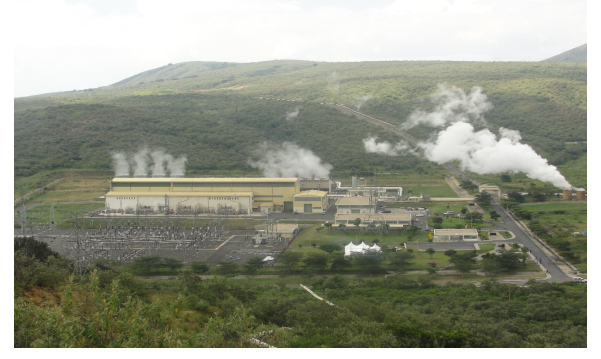
FIGURE 4: View of Olkaria II power station