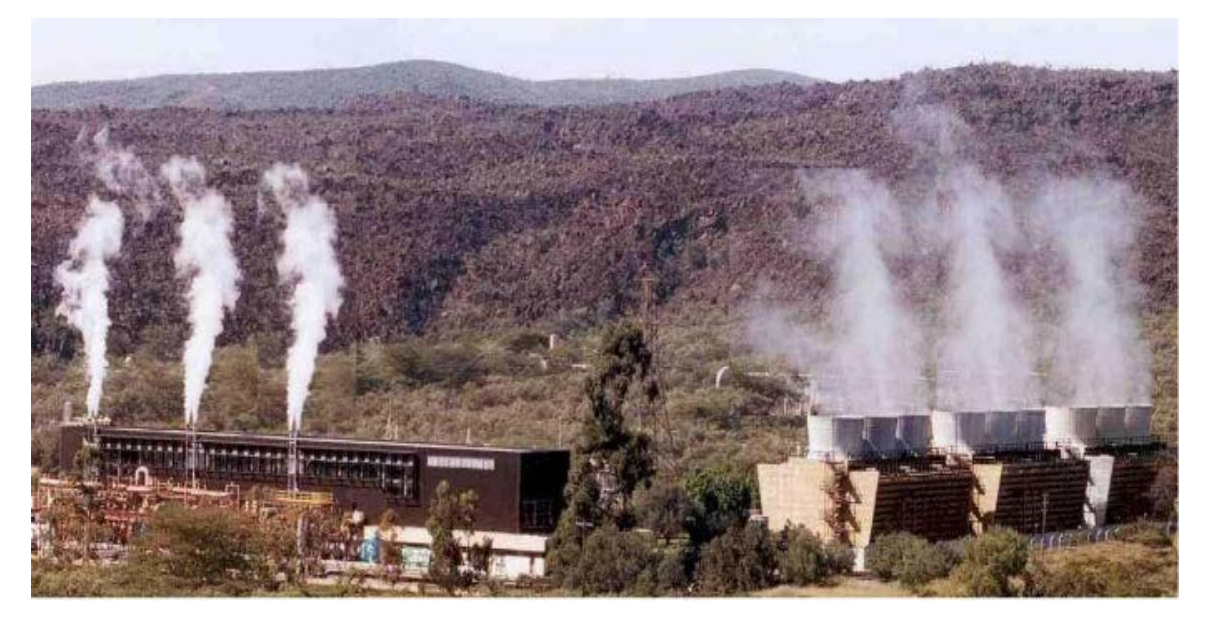
FIGURE 3: A view of Olkaria 1 Power plant located in the Olkaria East Production Field

In January 2009, a new plant was installed adding another 35 MWe to the plant's capacity. Later, 36 MWe production unit was installed in 2013. The fourth generation unit at Olkaria III, with capacity of 26 MWe was commissioned in 2014. The fifth unit with a capacity of 29.6 MWe was commissioned in February, 2016, bringing the total capacity at the plant to 139.6 MWe. This power plant draws its steam from the Northwest sector of the Olkaria geothermal field.