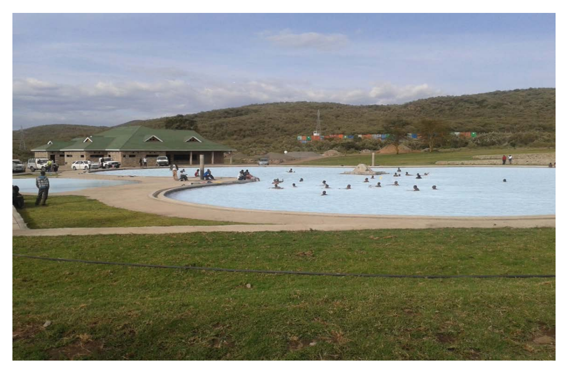
FIGURE 7: Olkaria Geothermal Spa

Plans for large scale direct utilization of geothermal resources were initiated in Menengai in 2015. GDC set up a direct-use demonstration project in Menengai to show how geothermal by-products can benefit communities through their use in green houses, leather tannery, dairy milk preservation, fish farming, meat processing and development of spas among others. Four demonstration projects have been set up in Menengai. They include geothermal powered dairy unit, geothermal heated aquatic ponds, geothermal heated greenhouse and geothermal powered laundry unit. To start off, a water bath has been constructed and stainless steel heat exchanger submerged inside the bath. Cold water is heated from 25°C to 85°C through counter flow movement. This hot water is supplied to various projects. A milk processing unit that uses heat from the geothermal heat exchanger for milk pasteurization has been set up as a pilot plant in Menengai. Hot water at 80 °C heats milk to a temperature of 65°C - 67°C for a period of 30 minutes. Milk is then cooled in two processes; using room temperature water and using ice water to temperatures as low as 4°C. Pilot plants have been set up for use in greenhouse heating, fish farming, milk pasteurization and laundry.