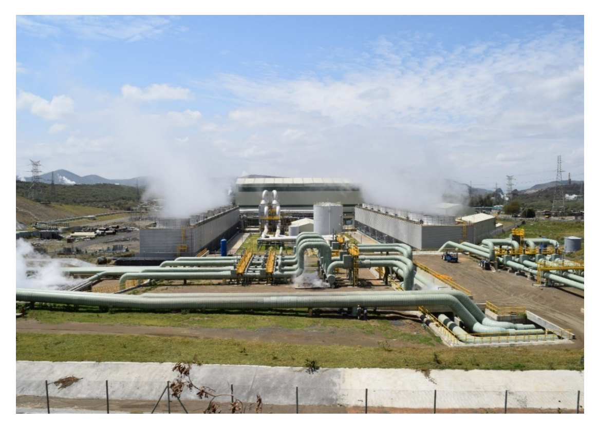
FIGURE 5: Olkaria IV power plant located in Domes area

The Olkaria 300 MWe project comprises the Olkaria IV (Figure 5) and the Olkaria I additional units 4 and 5. Each of the two power plants has an installed capacity of 150 MWe. Olkaria I units 4&5 draws steam from Olkaria East and partly Northeast sectors. In 1999, KenGen drilled three exploratory wells for Olkaria IV power plant, located in the Domes sector of the Olkaria geothermal field. The Government of Kenya, in 2006, funded appraisal drilling for this field. Production drilling commenced in 2007 by signing of a six well drilling contract with the Chinese owned Great Wall company (GWC). With more steam being realized and the field proving to be successful, more production and injection wells were drilled. With improved drilling technology, deeper and directional wells going down to a depth of 3 kms were drilled in Domes area. In 2009, the first optimization study for the Olkaria geothermal field to sustain additional production of 150 MWe for the Olkaria IV power plant and 150 MWe for the Olkaria I unit IV&V units. Construction works on the each of the 150 MWe power project for Olkaria I units IV&V and the Domes field began in March 2012 and on 23<sup>rd</sup> July 2012 respectively.