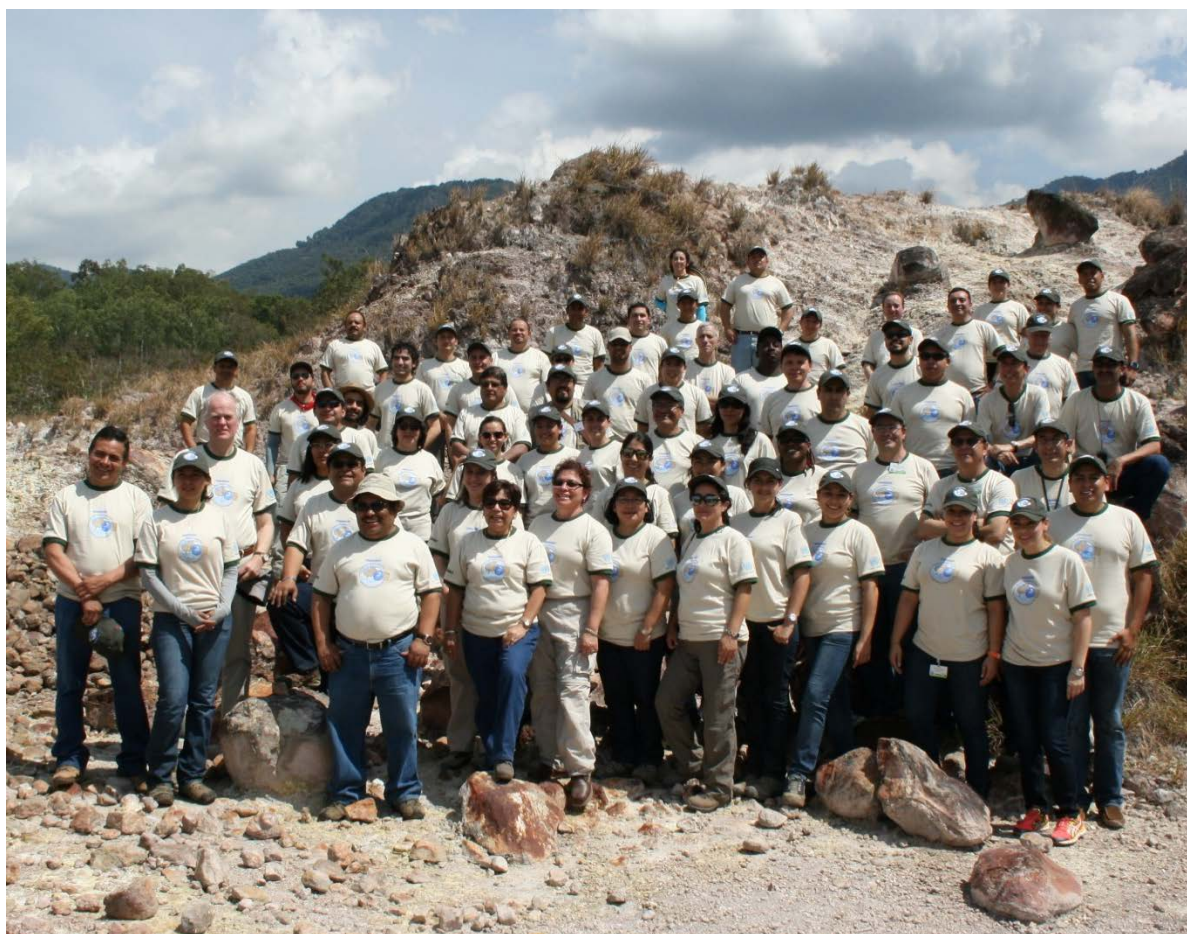
FIGURE 7: Participants and lecturers in the El Salvador Short Course in 2015