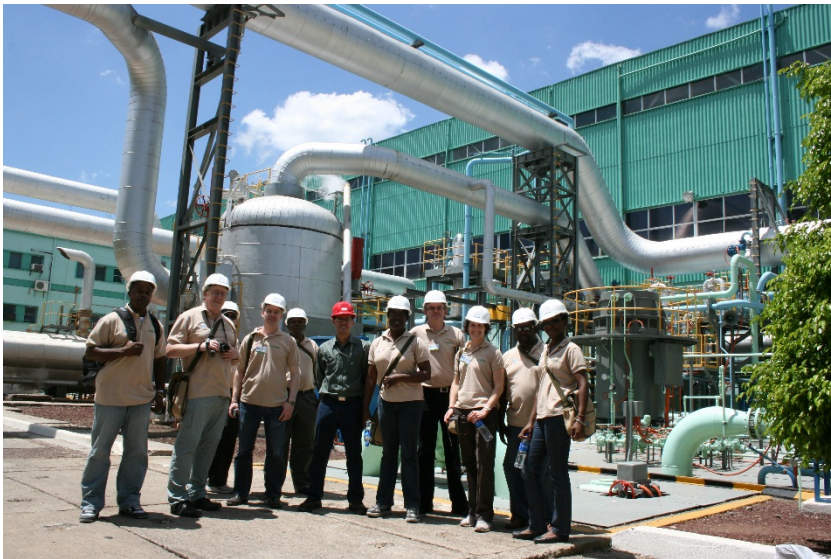
FIGURE 1: Some lecturers and participants in the Short Course IV in 2012 visiting the Ahuachapán geothermal power plant in El Salvador