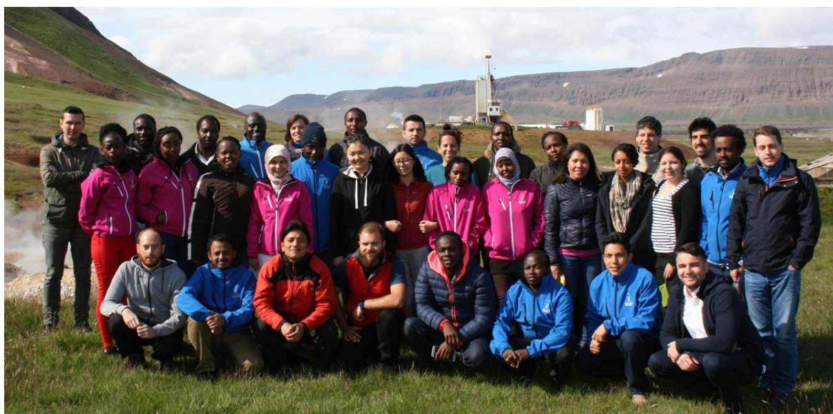
FIGURE 4: UNU Fellows in Iceland for the 6-month training in 2016

The largest groups of UNU Fellows have come from Kenya (109), China (84), the Philippines (40), El Salvador (38), and Ethiopia (36). Figure 4 shows the UNU Fellows who attended the 6-month training in 2016.