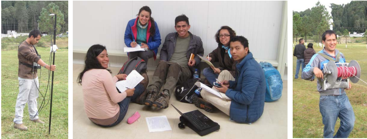
FIGURE 8: Participants of Short Course on Geothermal Exploration carrying out exercises in Los Azufres

In 2014, UNU-GTP cooperated with the Mexican Centre for Innovation in Geothermal Energy (Centro Mexicano de Innovación en Energía Geotérmica – CeMIEGeo) in conducting a short course in Mexico. Short Course on Geothermal Exploration was held in Los Azufres during 24-29 November of that year. The course was attended by 42 participants from different geothermal companies, institutions and universities in Mexico (Figure 8). Lecturing was mostly carried out by Icelandic experts from ÍSOR – Iceland GeoSurvey.