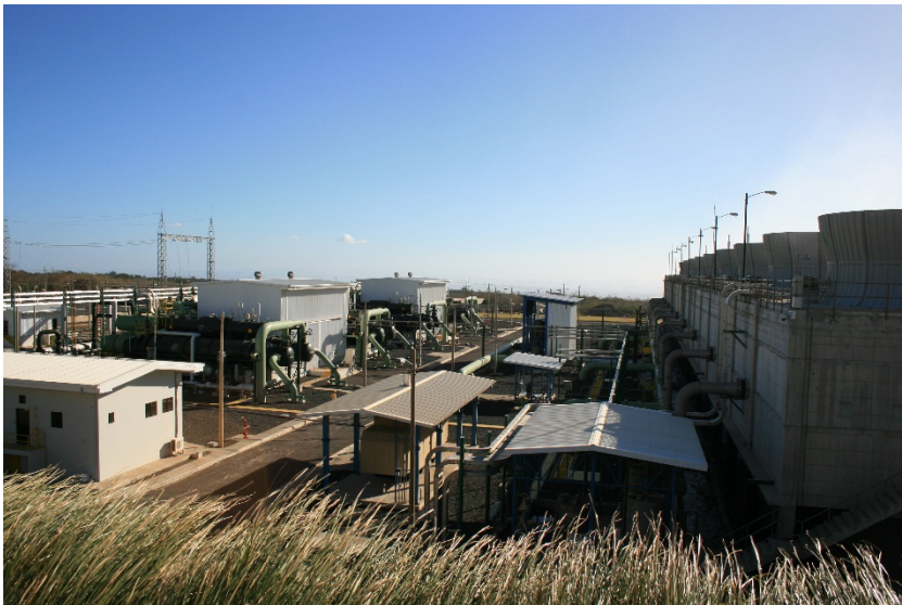
FIGURE 2: The Las Pailas binary geothermal power plant in Costa Rica

Central America is one of the world's richest regions in geothermal resources. Geothermal power stations provide 13% of the total electricity generation of the four countries Costa Rica, El Salvador, Guatemala and Nicaragua, according to data provided from the countries (CEPAL, 2014; see also Table 5). In each of the 4 countries there are geothermal power plants in operation in two geothermal areas. The photo in Figure 1 is taken at the Ahuachapán geothermal power plant in El Salvador, while Figure 2 shows the recent Las Pailas binary power plant in Costa Rica. The electricity generated in the geothermal areas is mainly replacing electricity generated by imported oil. The geothermal potential for electricity generation in Central America has been estimated some 4 GWe (Lippmann 2002), but less than 0.7 GWe have been harnessed so far. Exploration and production drilling has been ongoing in several new fields in the region with positive results, most recently in the San Vicente field in El Salvador.