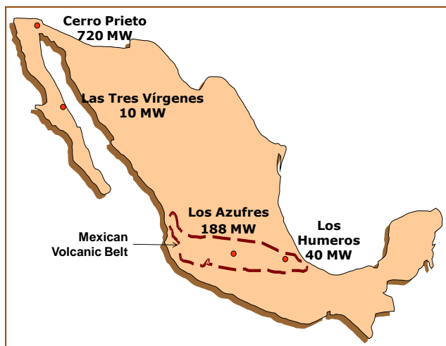
FIGURE 1: Location of the Mexican geothermal

There are four geothermal fields in operation for electricity generation in Mexico. They are Cerro Prieto, Los Azufres, Los Humeros and Las Tres Vírgenes, located as shown in Figure 1. All fields and power units are owned and operated by the Comisión Federal de Electricidad (CFE), the federal utility in charge of the electric market in Mexico for public service. However, the steam-field and the power units are managed by distinct business units of CFE in each geothermal field.